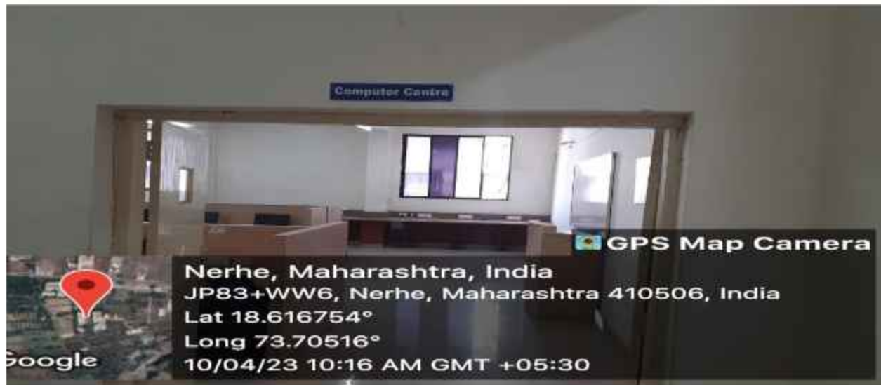
Photo of Computer Lab

Affiliated to Savitribai Phule Pune University Approved by AICTE, Ministry of HRD, Govt. of India