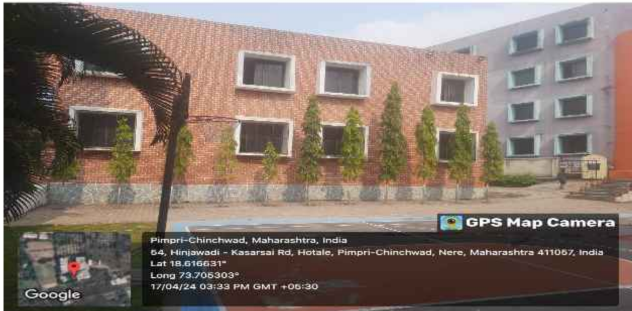
Photo of Building

Affiliated to Savitribai Phule Pune University Approved by AICTE, Ministry of HRD, Govt. of India